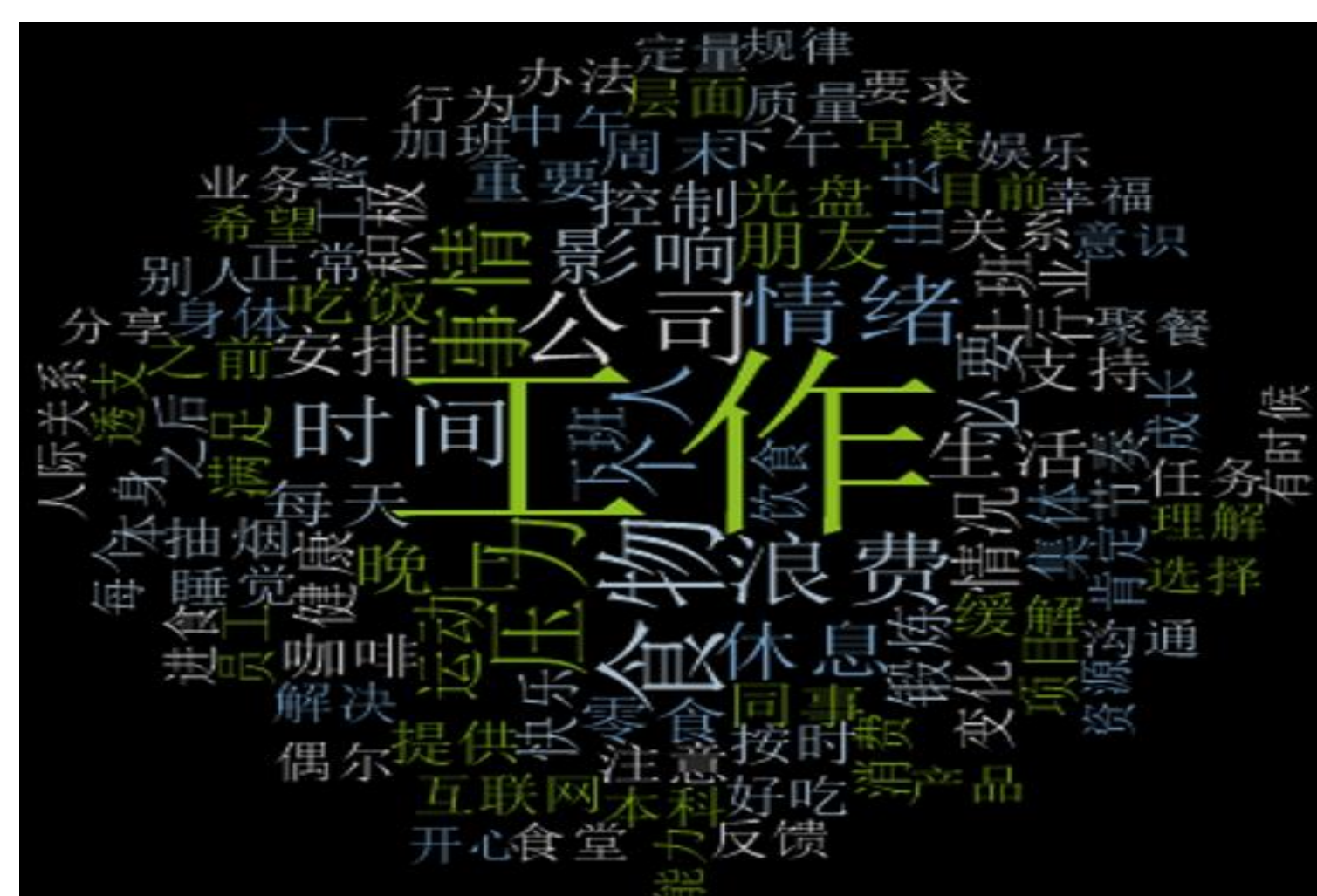
Figure 1. NVivo word cloud